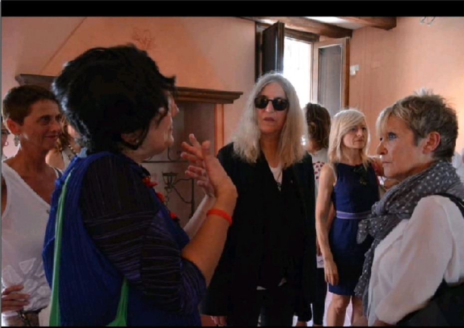
1 Agosto 2015 Casarsa: Visita al Centro Studi PPP di PATTI SMITH ed il gruppo di accompagnatori