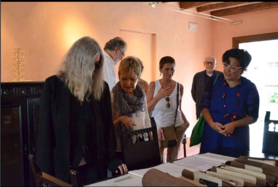
1 Agosto 2015 Casarsa: Visita al Centro Studi PPP di PATTI SMITH ed il gruppo di accompagnatori